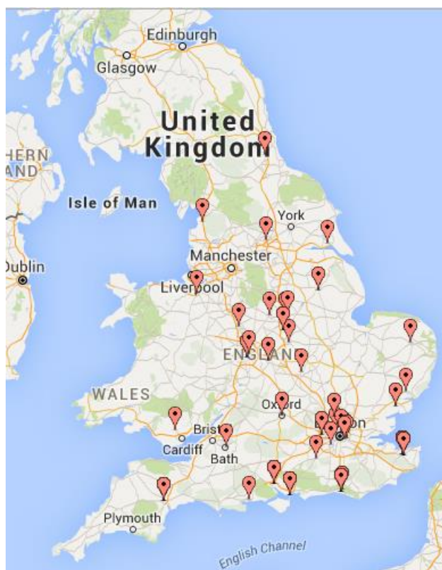
Map of University Destinations 2016 from St Thomas More

St Thomas More is proud to send most of its students onto higher education – 85% in 2016, 24 students being placed at prestigious Russell and 1994 Group universities. At our sixth form we support our students with their personal statements, help them to complete on the online UCAS form and we have a fantastic university selection tool in the Unifrog platform.